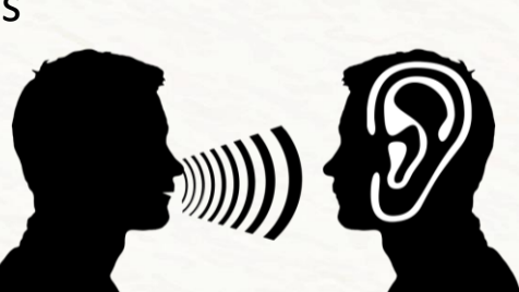
Listen to their opinions without judging