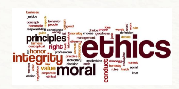
Morals and Ethics