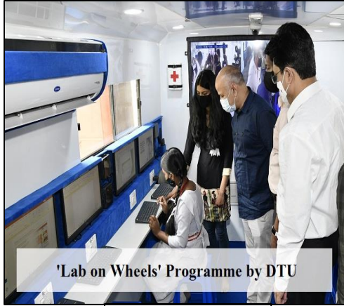
'Lab on Wheels' Programme by DTU