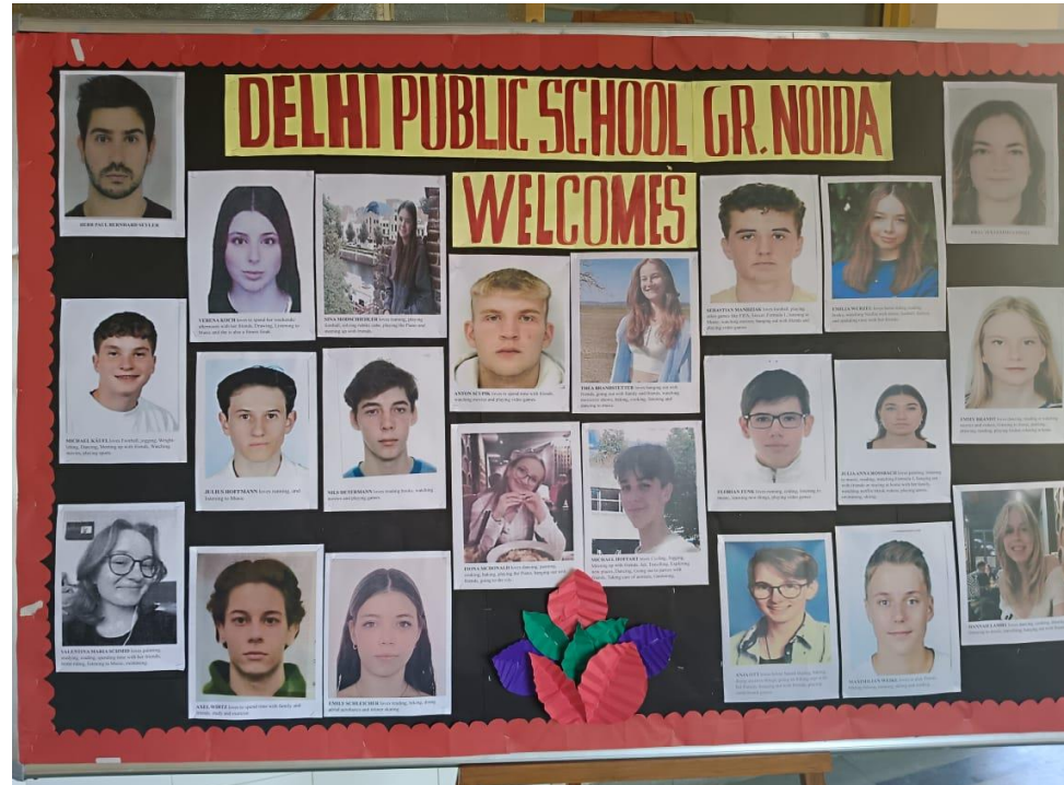
DPS-German Student exchange