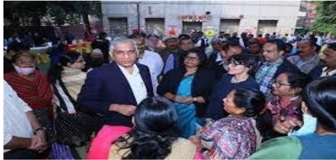
NDMC school Faculty exchange